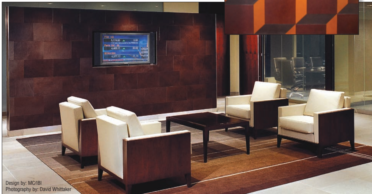
Design by: MC/IBI